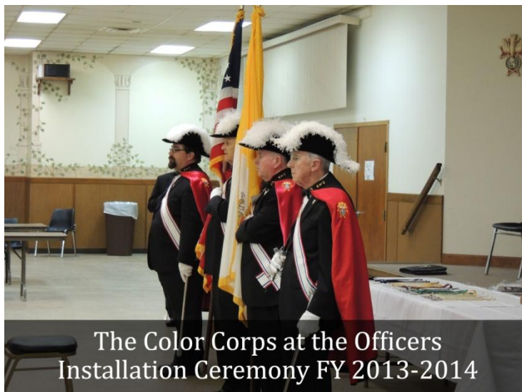
The Color Corps at the Officers Installation Ceremony FY 2013-2014