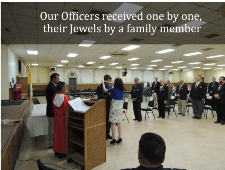
Our Officers received one by one, their Jewels by a family member